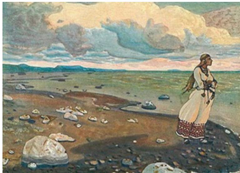
Beyond the Seas by Nicholas Roerich

tual upbringing. He asserted that during the state of a certain kind of meditation, which turns into a trance, such successful pupils go through the whole process of dying and then returning to life. All of them describe this process, and particularly, after darkness and a red sphere, crossing into a sphere of white light, as a state of indescribable ecstasy. There is a detailed description of the successive transference of consciousness through these spheres, with all the accompanying